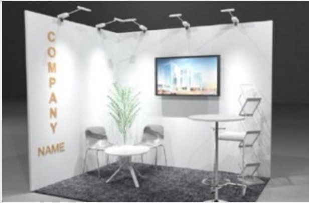
STANDARD 3X2 booth

PACKAGE "MINI" all incl: SEK 36.000 excl VAT