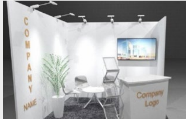
EXCLUSIVE 3X3 booth

PACKAGE "EXCLUSIVE" all incl: SEK 46.000 excl VAT